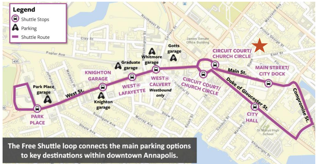
The Free Shuttle loop connects the main parking options to key destinations within downtown Annapolis.

Calvert Street Garage Requires State ID During Session 19 St Johns St Annapolis, MD 21401